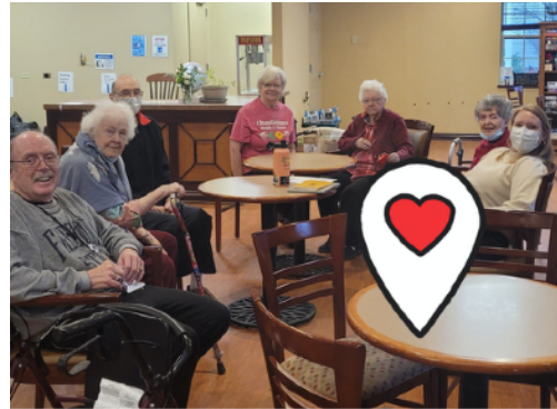
Bible Study at Fredonia Place