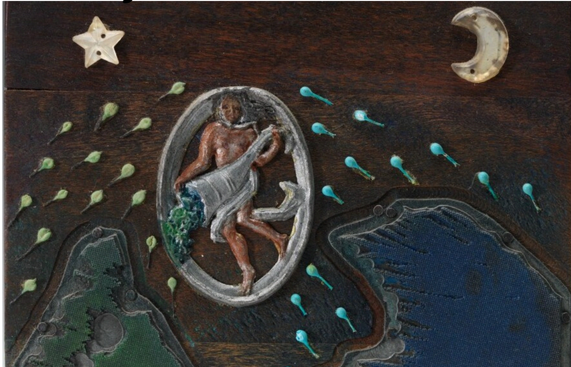
Betye Saar, "Twilight Awakening" 1978